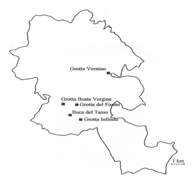
Figure 2 - Map of the five most important caves in the Regional Natural Park "Gola della Rossa e di Frasassi".